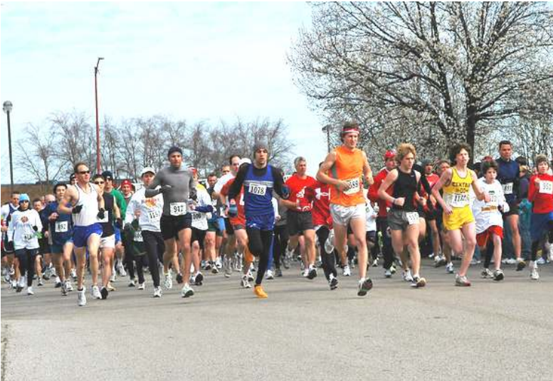
St. Patrick's Day 5k Evansville March 18, 2006